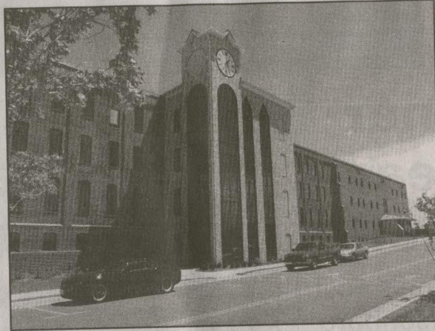
Faneuil Inc. announced Wednesday that it will open a call center in August at The Clock Tower at Commonwealth Centre in Martinsville, which is shown Wednesday.